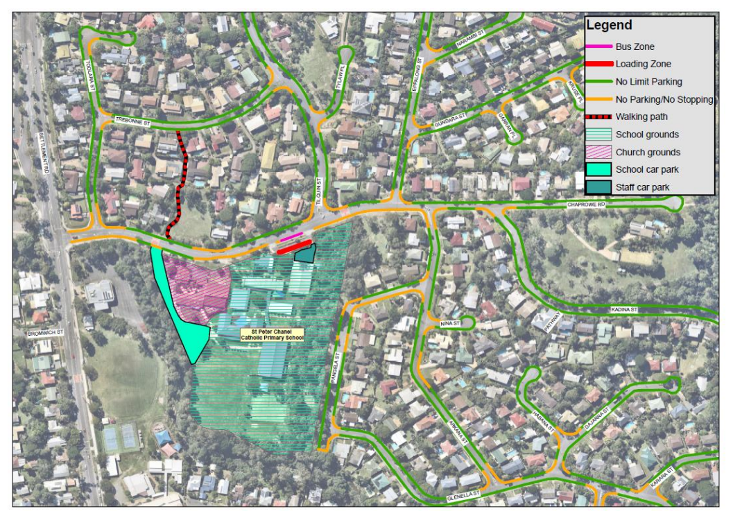
Figure 2: Map of parking areas

The staff car park at the front of the school, behind the Stop, Drop and Go Zone, is reserved for school and OSHC staff.