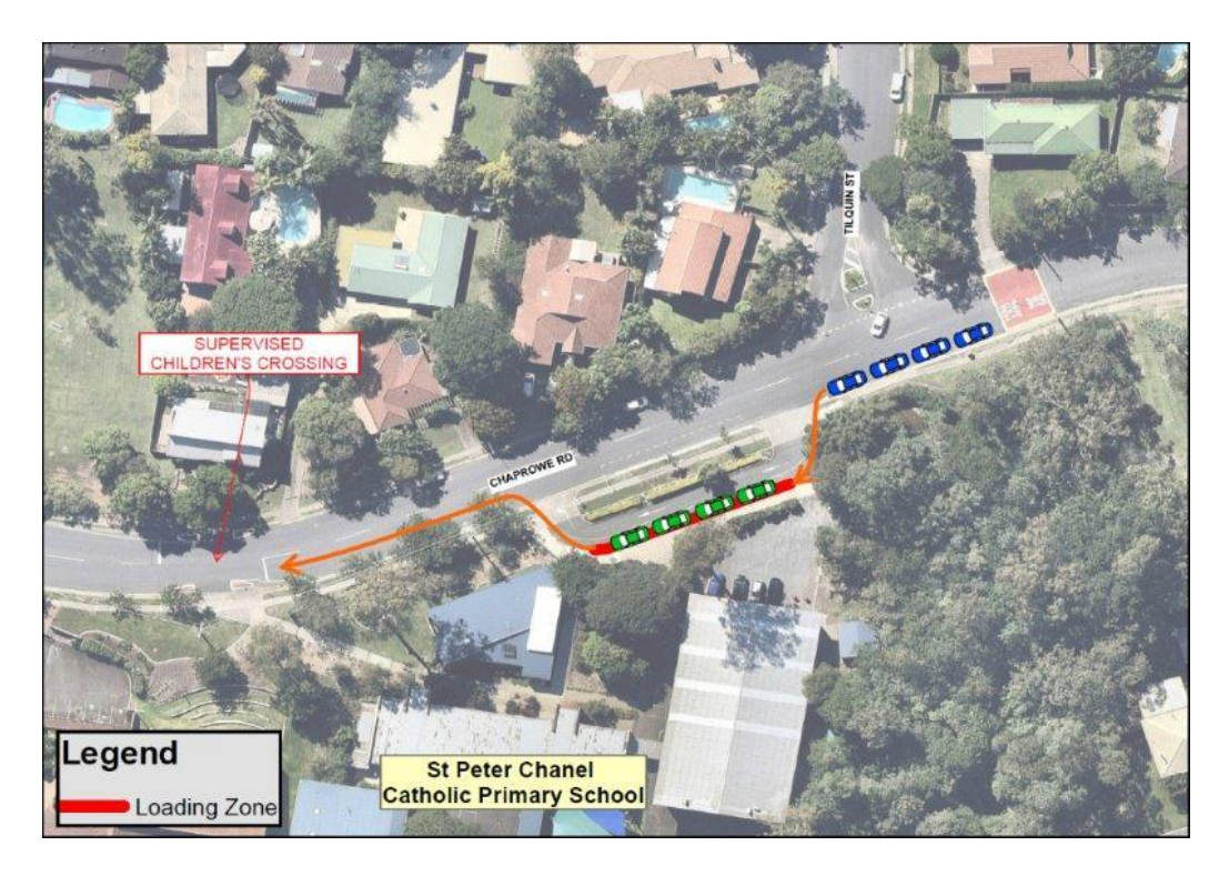
Figure 1: Map of Stop, Drop and Go Zone