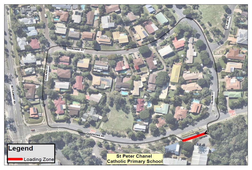
Figure 1b: Map of how to go around the block.